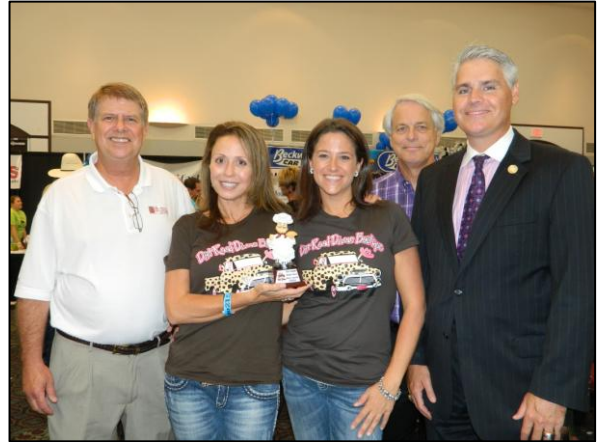
Awarding Dirt Road Divas for the "Most Creative Tabletop"