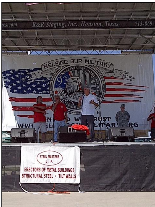
Speaking at Military Appreciation Day