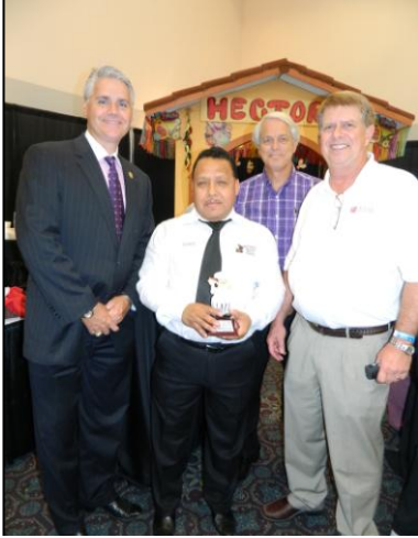
Awarding Hector's Mexican Grill & Cantina with "Best Decorated/Themed Booth"