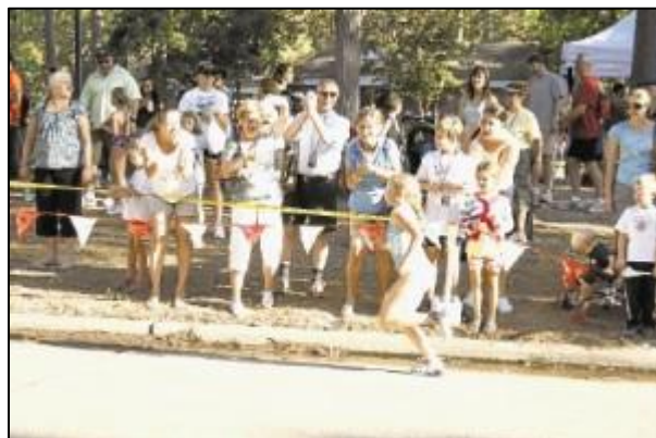
Kingwood Kiwanis Kids Triathlon Competitors Running at Bear Branch Pool