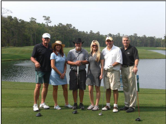
Left: Autumn's Dawn Golf Tournament